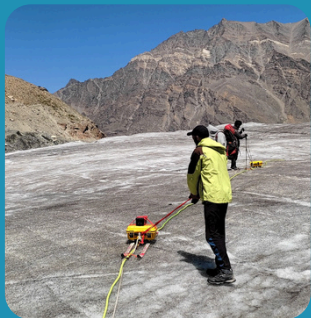
Ice Radar (GPR) measurements for glacier ice thickness