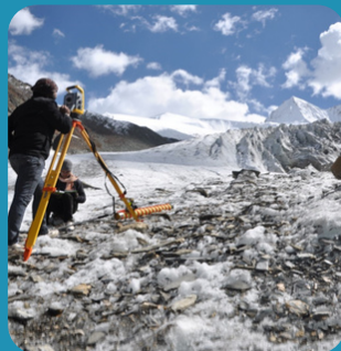
Electronic total station for glacier surface mapping