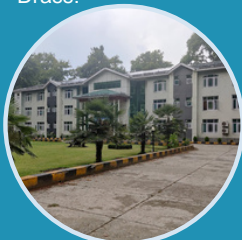
KU, Guest House

Accommodation University Guest House in the main campus University of Kashmir which is situated at Hazratbal in Srinagar. It is flanked by the world famous Dal Lake on its eastern side and Nigeen Lake on the western side. The Main Campus of the University spread over 247 acres of land is divided into three parts – Hazratbal Campus, Naseem Bagh Campus and Mirza Bagh Campus (serving residential purpose). The tranquil ambience of the Campus provides the right kind of atmosphere for serious study and research. Guest house will be provided to the participants during the theoretical part of the program. However, during field expedition to Machoi glacier the participants will be accommodated in tents at the base camp of the glacier or hotels located in Drass.