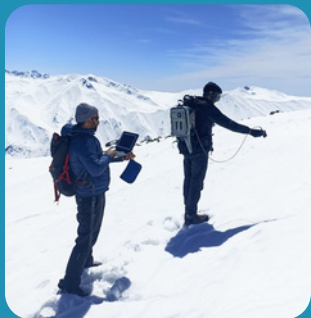
Spectro-radiometer measurements of snow