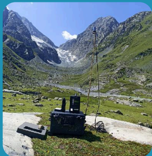
Black Carbon measurements at glacier site using Aethalometer