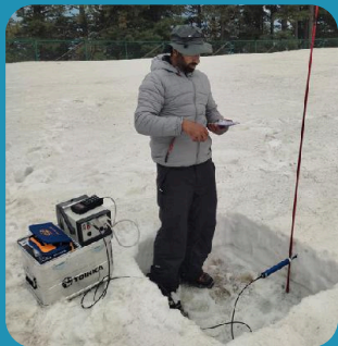
Snow physical parameter retrieval using Snow fork