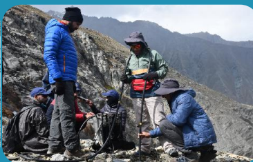
Mass balance measurements by school participants at glacier site