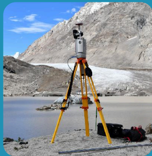
Terrestrial Laser Scanner (TLS) for 3-D mapping of glaciers