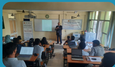
Resource person delivering lecture to participants at Kashmir university (KU)