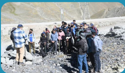
Field training of school participants at the Machoi glacier site