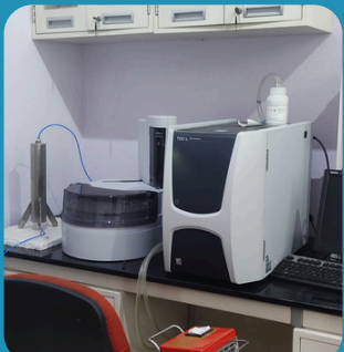
Chemistry lab for the measurement of TOC, EC