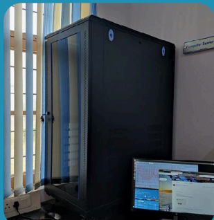
High power computing facility for climate and weather modelling