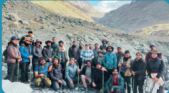
Participants of 2023 Glaciology school at the Machoi glacier site

Leading experts in glaciology, glacio-geomorphology, glacier-hydrology, climate change, and related disciplines from esteemed national and international institutes will serve as resource persons, delivering lectures on both theoretical and practical aspects of these fields. These lectures will cover the latest research developments, methodologies, and technologies used in glaciological studies. Additionally, highly trained glacier scientists and field glaciologists will act as course instructors, providing hands-on training and fieldwork experience. Participants will engage in practical exercises, including ice core drilling, data collection, and analysis using advanced instruments and techniques. This approach is designed to equip participants with essential field knowledge and skills, particularly in field glaciology and the use of relevant instrumentation, thereby enhancing their expertise and capacity in these areas. The training program aims to foster a deeper understanding of the dynamics of glaciers and their impact on global climate systems.