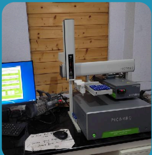
Laser Isotope Analyzer for stable water isotope analysis