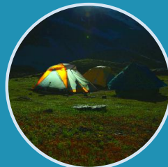
Machoi Base Camp