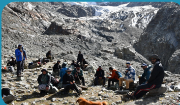
Participants enjoying light refreshment at the Machoi glacier site