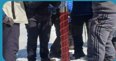
School participants doing ice coring at the Machoi glacier site