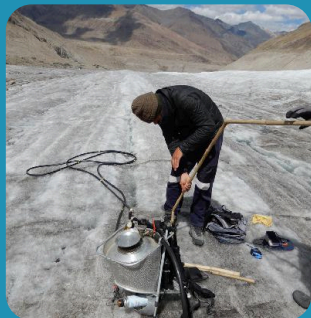
Heuke's Drill for mass balance measurements of glacier