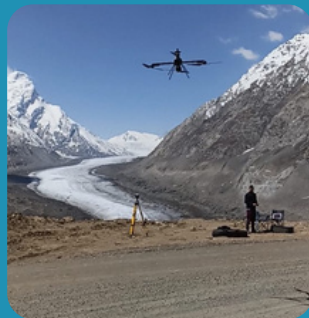
Unmanned Aerial Vehicle (UAV) for 3-D surface mapping