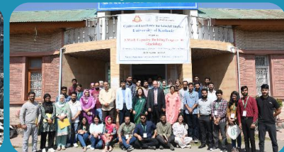
Participants of the Valedictory function of the 2023 summer school at KU