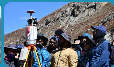
Use of Terrestrial laser scanner (TLS) at the Machoi glacier site