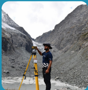
Differential GPS for geodetic mass balance of glaciers