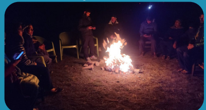
Bonfire after tiresome field expedition during 2023 summer school