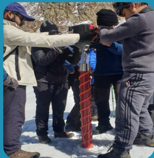
Ice Core drilling for paleo-climate reconstruction