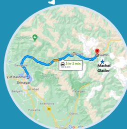
KU to Machoi Glacier