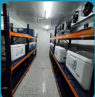
Ice Core Storage facility for archiving glacier ice cores