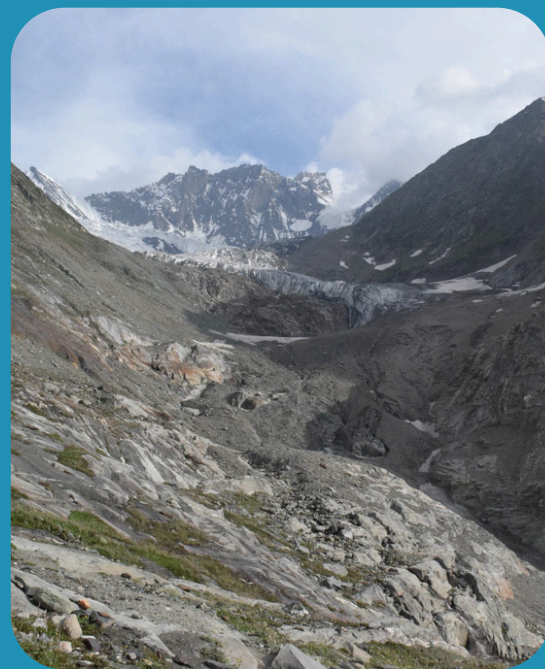
The Machoi glacier: Glacier Field site