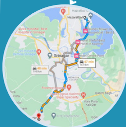
Airport-TRC to KU